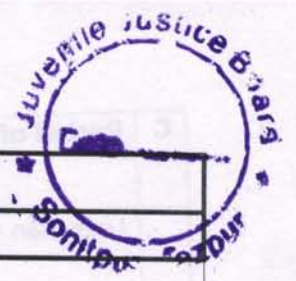
Table No. 13: Juvenile Justice Board (JJB)

Month & Year: NOVEMBER -- 2020 District: SONITPUR