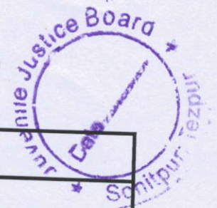
Table No. 13: Juvenile Justice Board (JJB)