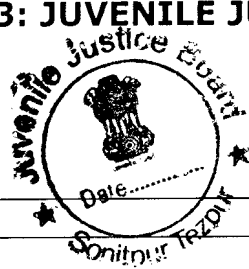
TABLE NO. 13: JUVENILE JUSTICE BOARD (JJB)